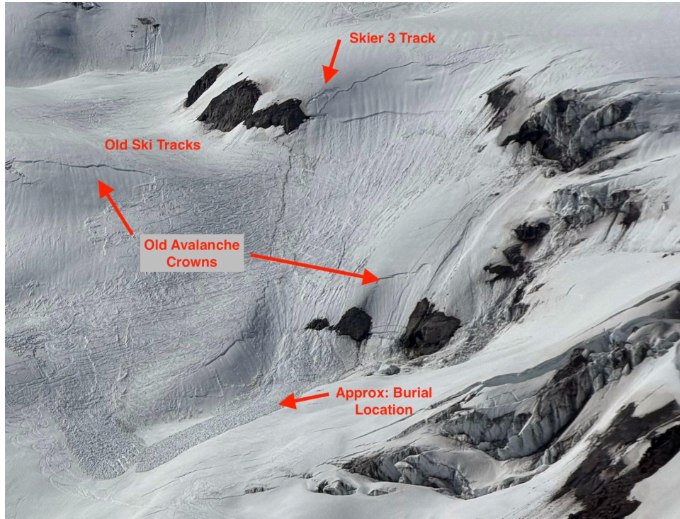
Image 2: An overview of the accident site, including skier 3's track, as seen from near the Muir Snowfield.