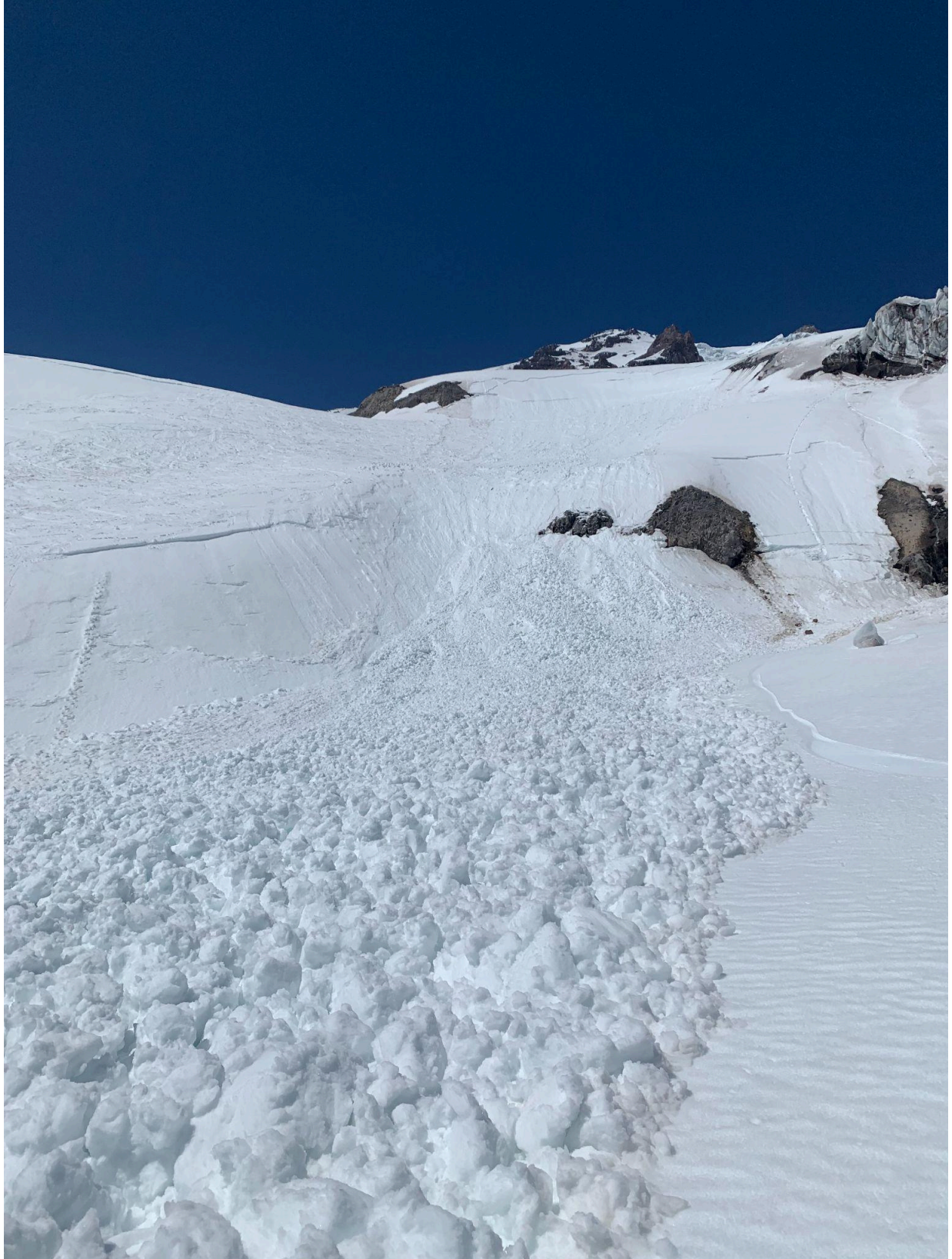
Image 3: Looking up the avalanche from the burial site.